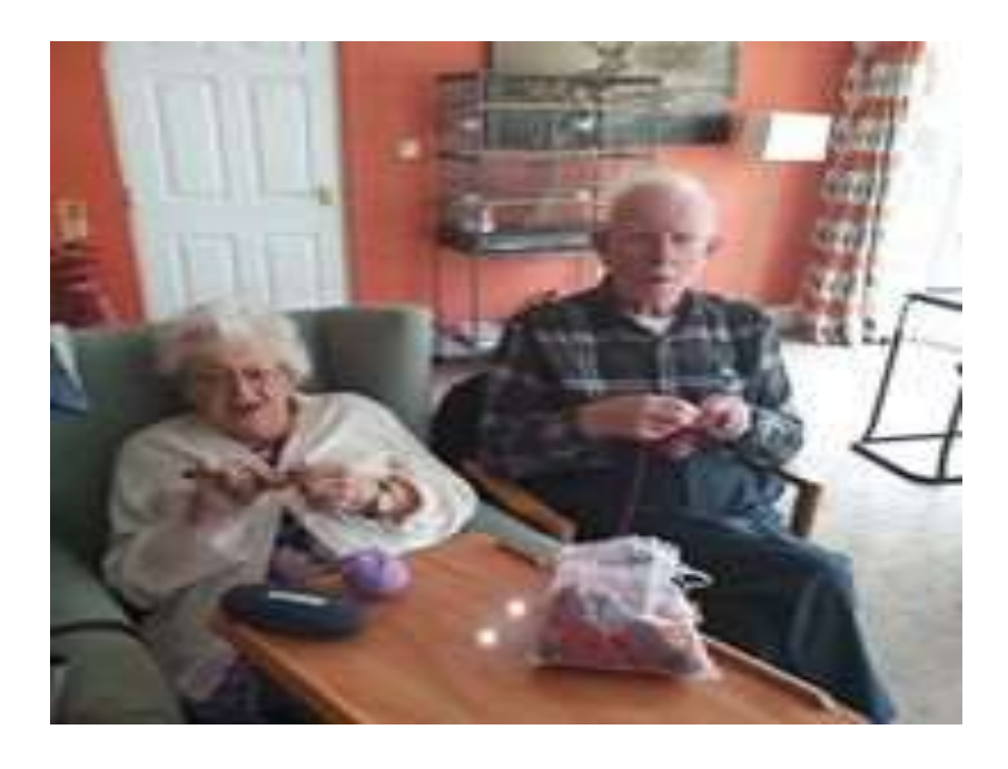
This lovely couple spent the day knitting together.